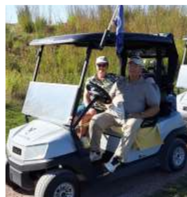
One more hole!