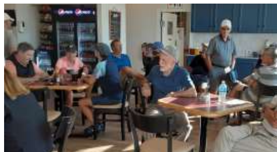
The nineteenth hole